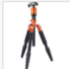
Rollei Compact Travel Tripod