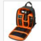
VOSMEP Camera Bag