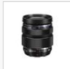
Olympus M.Zuiko Digital ED 12-40 mm 12.8 Top Pro lens for Micro Four Thirds lens bayonet