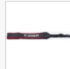
Canon EW 100DGR Trageriem