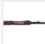
Canon EW 100DGR Trageriem